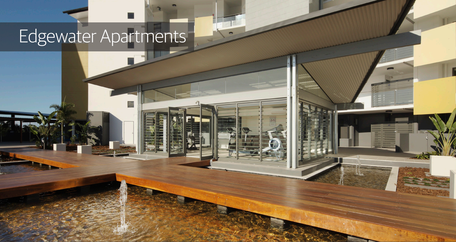
Resident gymnasium with a view