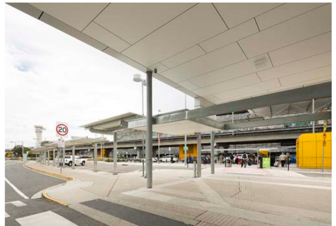
Brightly coloured cladding forms easy to recognise passenger transit options from a distance